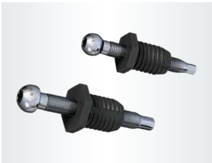
Top: Modular Adjuster 400 Below: Modular Adjuster 800