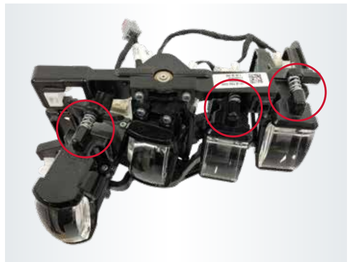
Applications in LED modules of a headlamp